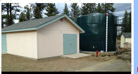
IHS—Shackleford Comm. Water System