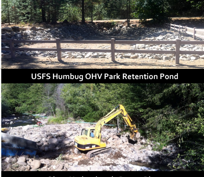
Olsen Hydroelectric Power Plant Hydroelectric Dam Repair