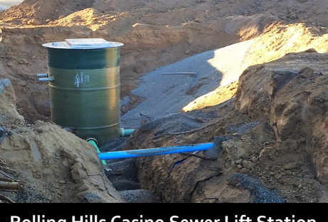
Rolling Hills Casino Sewer Lift Station