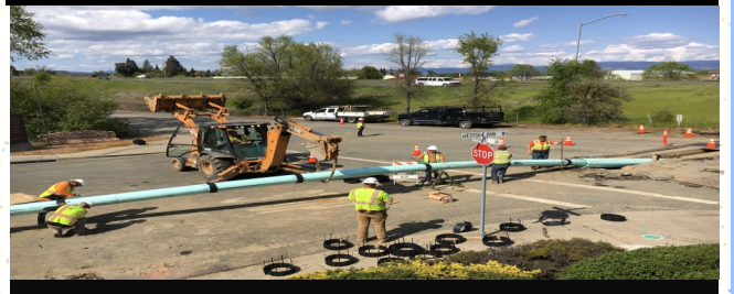
Lakeport Hwy 29 Main