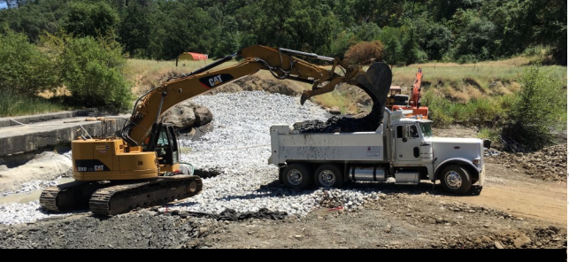
Millville Diversion/Clover Creek Fisheries Restoration