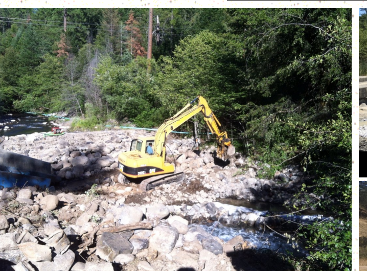
Olsen Hydroelectric Power Plant Hydroelectric Dam Repair