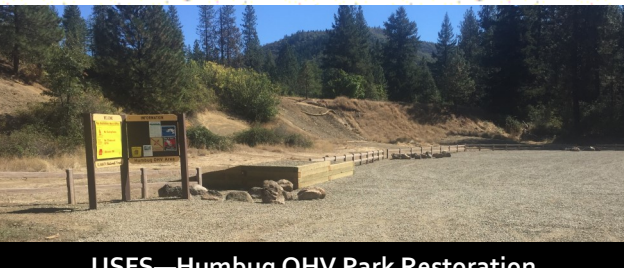
USFS—Humbug OHV Park Restoration

Millville Diversion/Clover Creek Fisheries Restoration