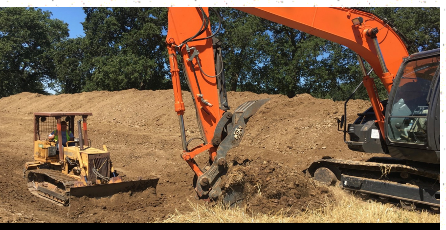
WSRCD—Millville Diversion/Clover Creek Fisheries Restoration Project